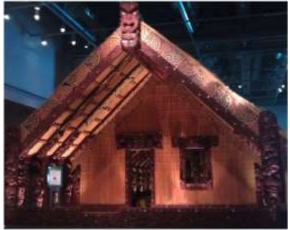
Traditional Maori home or marae

Sometimes a conversation shifts almost of its own accord. Another anecdote: the other day, my husband (yes, I did eventually get married) and I had friends to dinner, and a remark from one guest prompted me to speak about my parents. When I reached a natural pause, someone asked another guest about their parents. And so it went on, with each person telling a very different family story. It reminded me of the Maori practice of “whakapapa”, where people coming together for the first time share stories about their ancestors (Wikipedia: someone reciting their whakapapa “proclaims their identity, places themselves in a wider context, and links themselves to